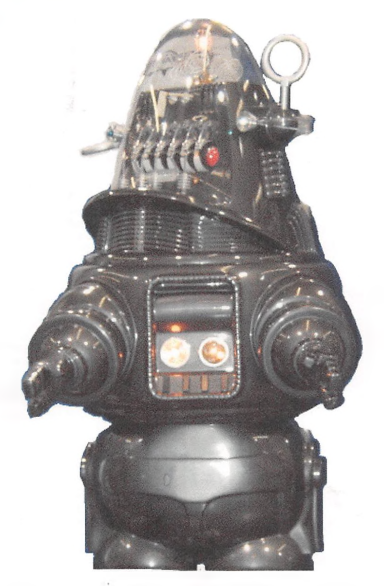
We Have Lots of Robots, But Still None Like This..